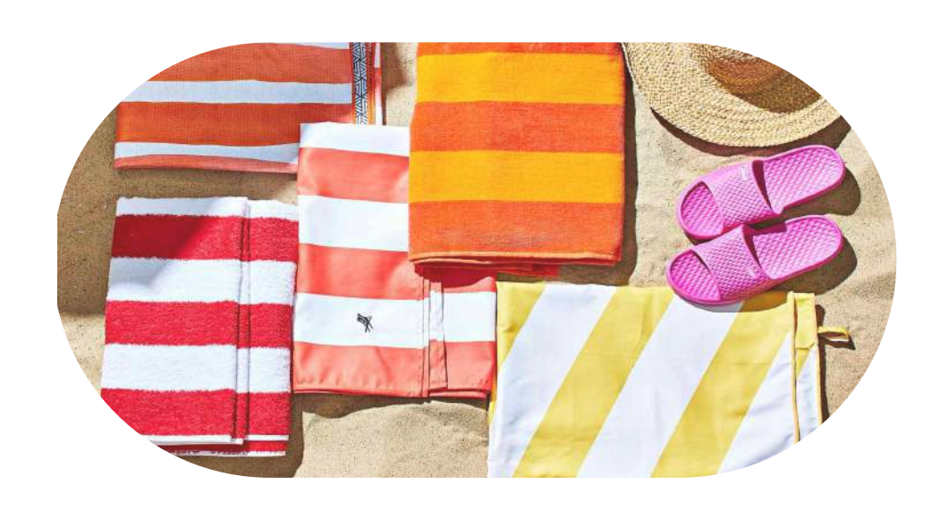
Soft, durable white terry towels, 100% Cotton range of soft, fresh white, dyed and J card towels